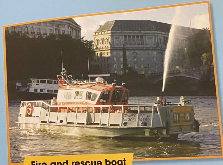
Fire and rescue boat

Firefighters use boats for emergencies on rivers. They rescue people from ships that are sinking or on fire. The boats have pumps that use river water to put out fires.